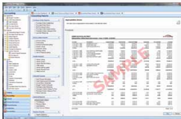
nVision Report Viewer